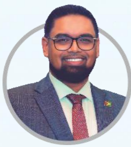
Dr. Mohamed Irfaan Ali President Co-operative Republic of Guyana