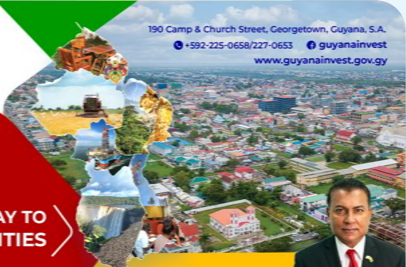
H.E. Dr. Mohamed Irfaan Ali President, Co-operative Republic of Guyana